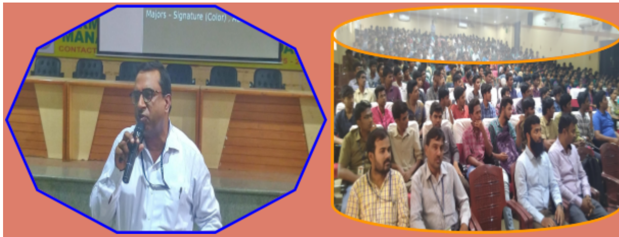
Eminent speaker from TIME addressing the gathering

An awareness programme on "Career Options after B.Tech" for Ist, IInd and III year B. Tech Students in association with TIME Institute, Hyderabad on 26th and 27th February, 2019. Experts from TIME Institute, explained job opportunities in the software and industry sector for B.Tech students. They enlightened the students with valuable tips on employability skills. Finally the experts asked the students to enhance emphasis on M.B.A, M.Tech, M.S & other job opportunities.