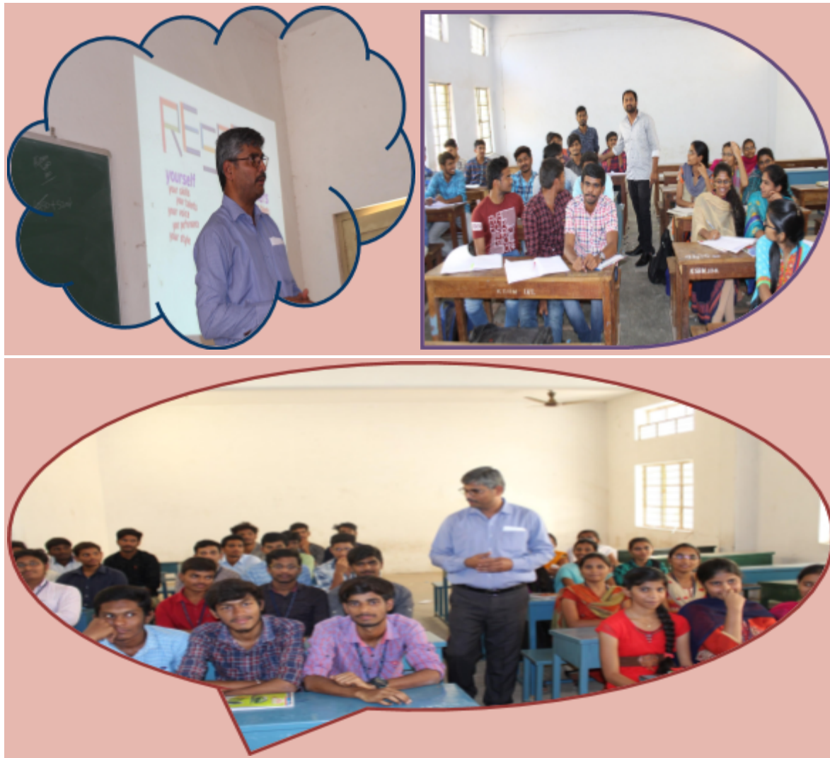
Campus recruitment trainer interacting with the students in the class

A Six Day Campus Recruitment Training Programme was organized for II-B.Tech Students from 18th Feb.2019 to 23rd Feb.2019 in association with M/s. Coign Consultants Pvt. Ltd., Hyderabad. Students have been trained up well on areas like Quantitative Aptitude, Reasoning Verbal Abilities and Soft Skills, which are essential to the students for getting jobs.