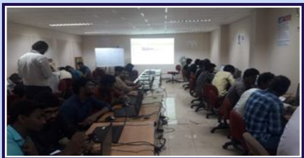
Workshop faculty with the students