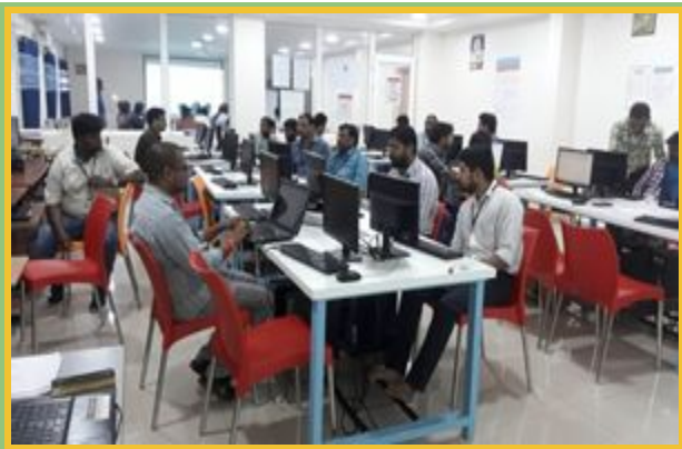
Learning new things in the workshop