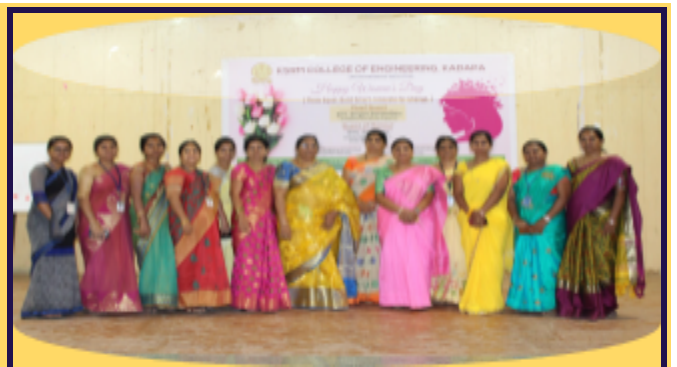
Peace Rally for Pulwama Attack Martyrs International Women's Day celebrations