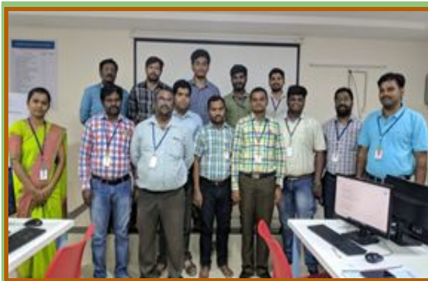
Group photo with instructors in training session