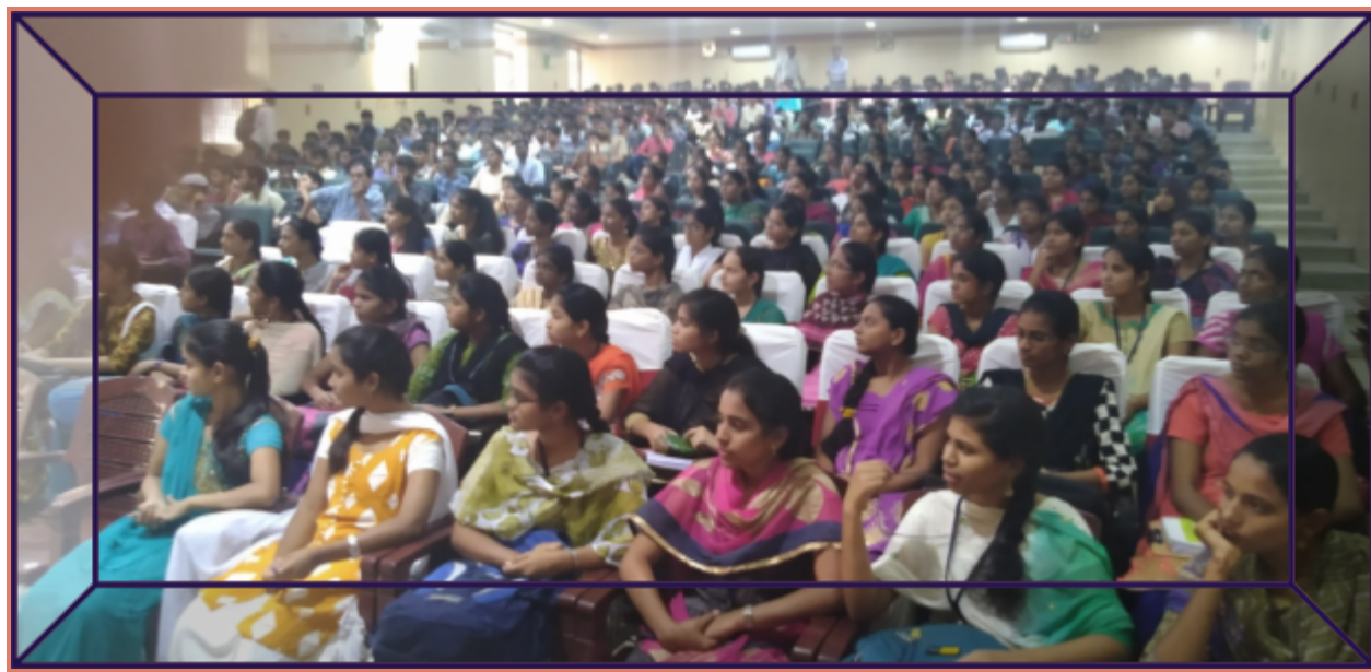
Students listening to the concepts on career options after B.Tech