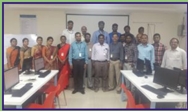
Snap taken at the completion of the workshop